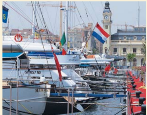
Superyachts berthed at the pier are surrounded by the 12 team bases.