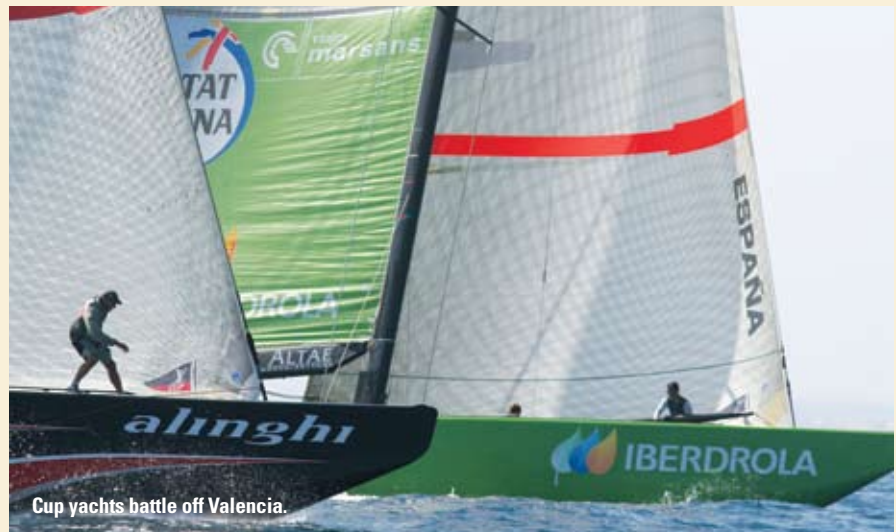
Cup yachts battle off Valencia.

Lonja de la Seda/the Silk Exchange, tel: 34 963 525 478 ext. 4153