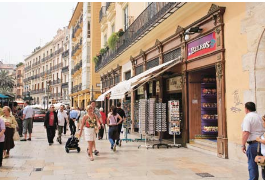
Walking along the pedestrian mall near the main cathedral in Valencia's historic center.

theaters. Unlike the legendary Spaniard El Cid, who took Valencia by storm, taking in the sights in a piecemeal fashion is the way to go for Cup visitors.