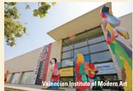
Valencian Institute of Modern Art

Restaurante Submarino de L'Oceanográfico*, tel: 34 961 975 565