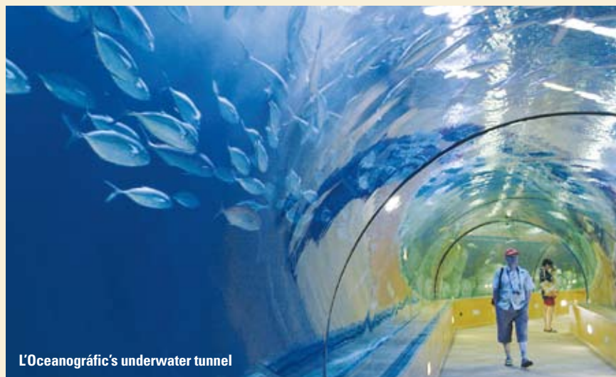
L'Oceanográfico's underwater tunnel

(Note: Many shops close for lunch 2-4:30 p.m.) □