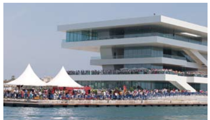
Spectators line the viewing platforms of the Veles e Vents building.

The Swiss America's Cup defenders, Team Alinghi, chose Valencia to host the 2007 event for its consistent winds and 300 days of sun a year. With the investment made by Spain and Valencia, and all the attractions the city has to offer visiting yachtsmen, the 32nd America's Cup should prove to be a must-make gathering. »