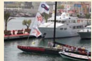
Italy's racer and its tender

WEBSITE: www.valenciasuperyachtmarina.com