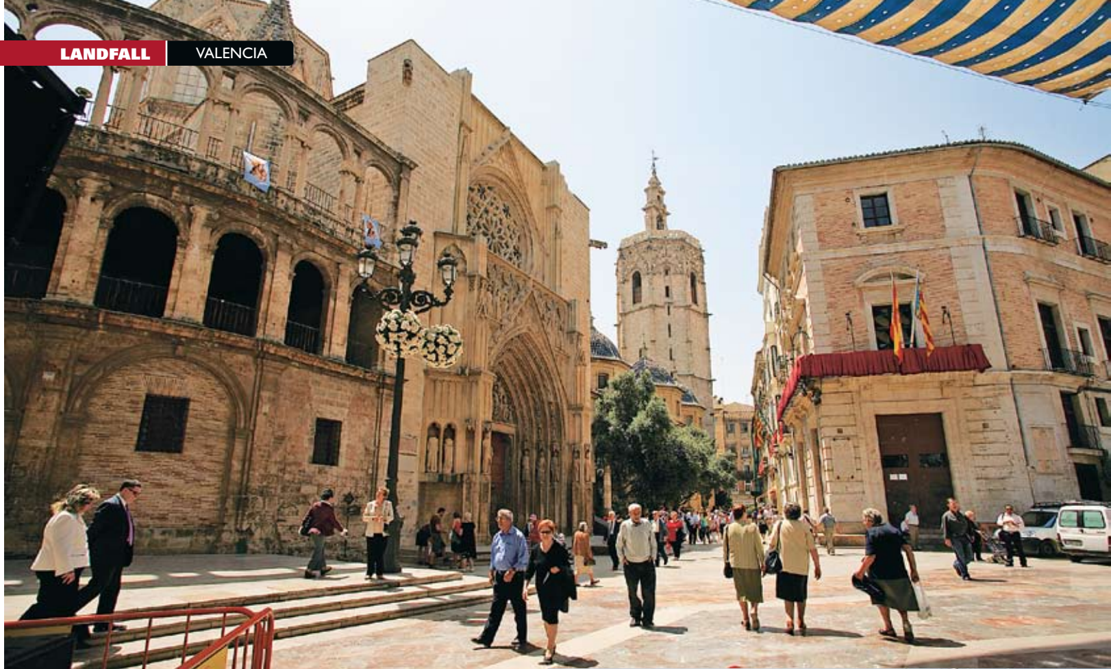
Clockwise from above: Plaza de la Reina (Queen's Square); the Swiss team's mother ship at the superyacht marina; spinnakers billow during the fleet race.