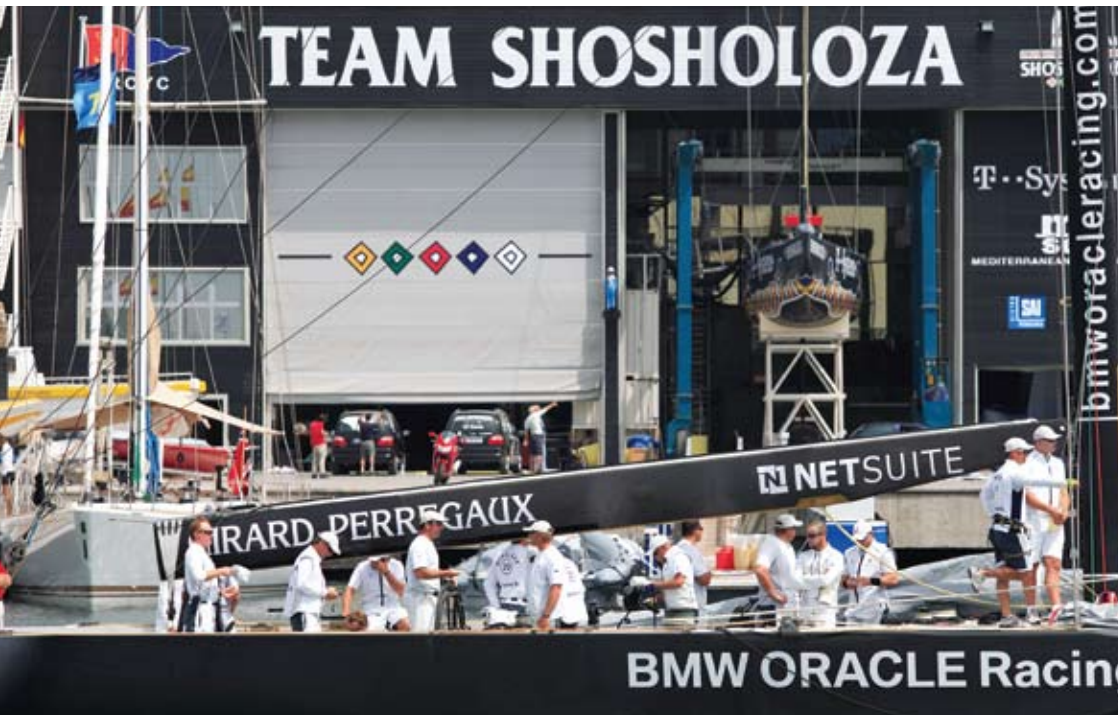
BMW ORACLE Racing team's boat passes in front of South Africa's Team Shosholoza base in Port America's Cup.

Porcelain, where three Valencian brothers first fired the white ceramic ware, is worthwhile. A visit to the showroom and private art gallery alone is worth the 10-minute drive, as is the factory tour.