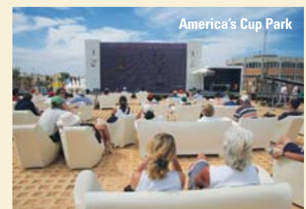
America's Cup Park